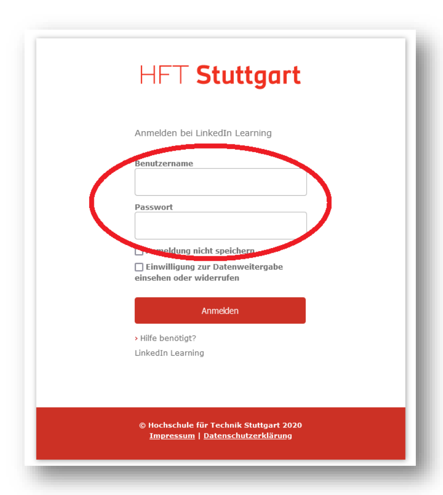
Step 2: Login with your HFT access data.